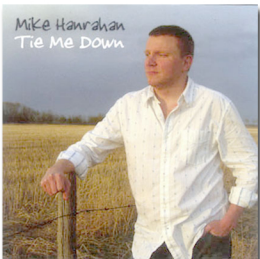
“TIE ME DOWN” 2005