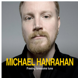
“FREEING LONESOME TUNE” 2009